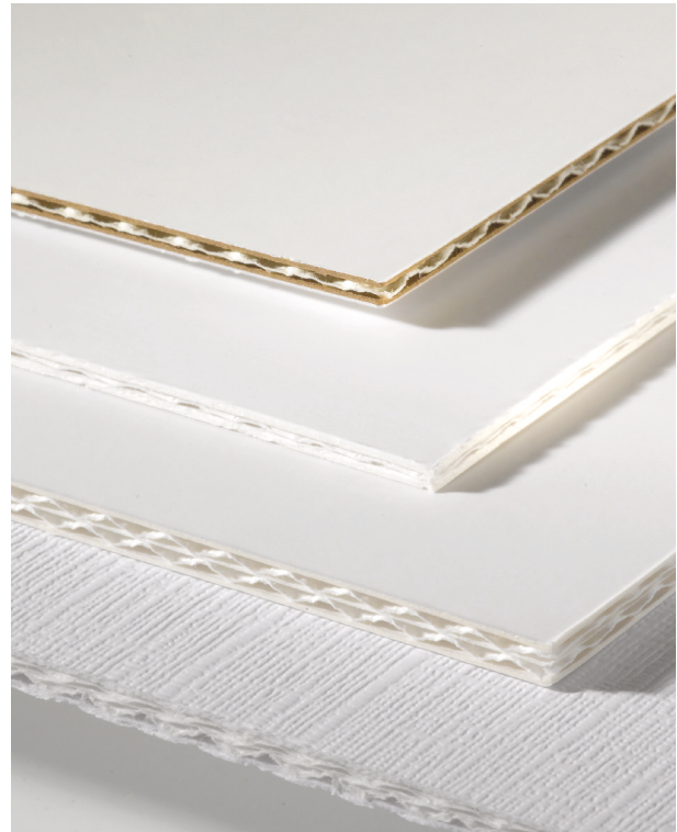
DISPA®outdoor | DISPA® 2.4 mm | DISPA® 3.8 mm | DISPA®canvas